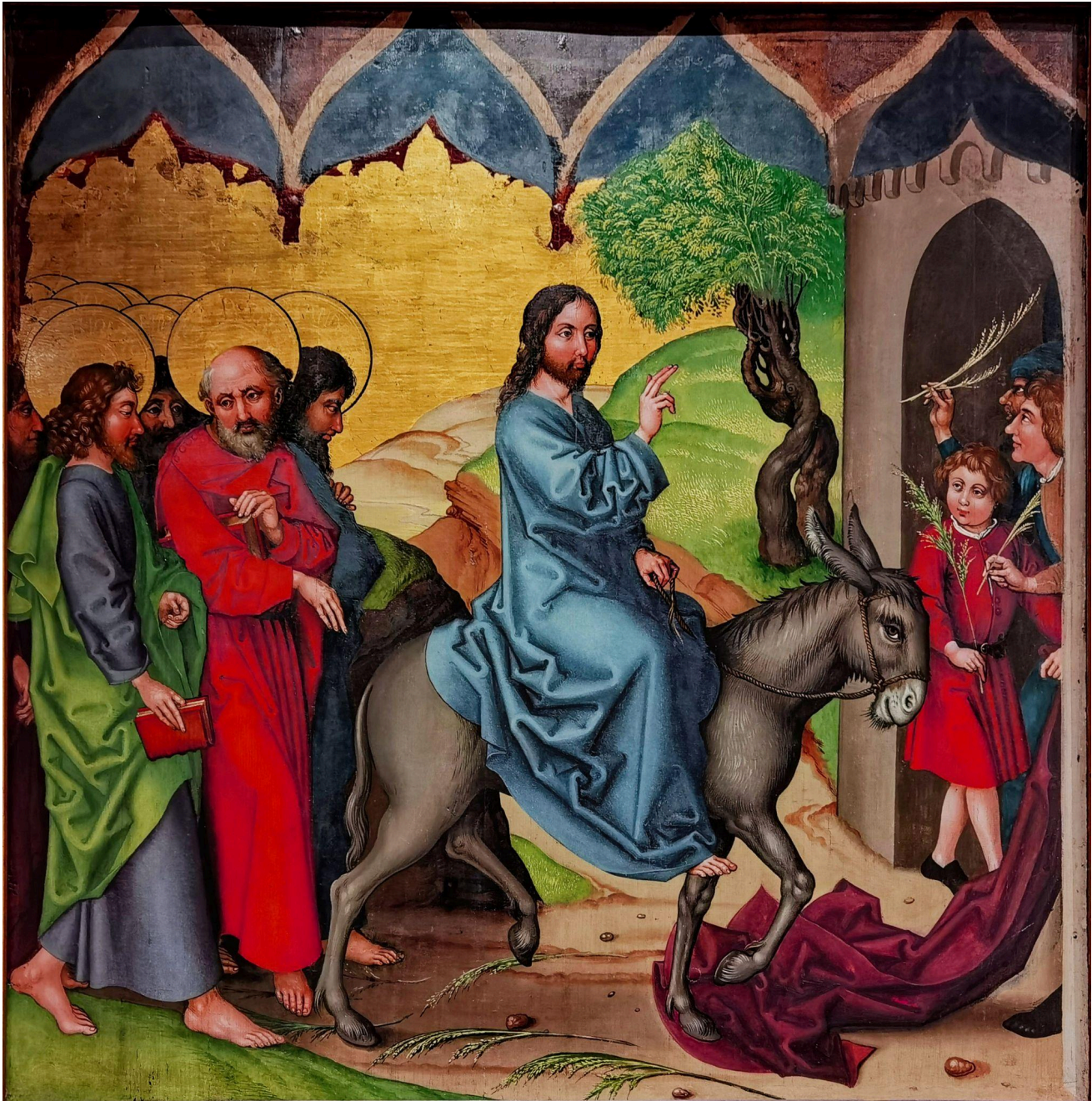
Colmar - Unterlinden Museum - Altarpiece Of The Dominicans, Childhood And Passion Of Christ Martin Schongauer (Ca 1445-1491) & Atelier, Ca 1480 - Oil On Wood Panel Palm Sunday, Jesus Entering Jerusalem On A Donkey